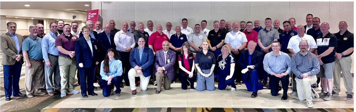
IFMA Members and Chapter Presidents 2024 Meetings, Orlando, FL

We hope that members will attend the meeting. NFPA Conference registration is not required, but IFMA Membership is required for the previous 180 days in order to vote on the Bylaws proposals and the election of officers.