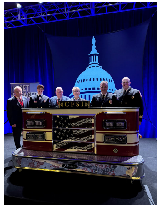
IFMA Board members checking out the view from the cab of the CFSI Engine