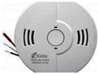
The alarms says Kidde on the front.

Of importance to us is a recall of Kidde combination smoke and CO alarms.