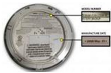
The back of the alarms shows the model number and manufacture date.

Kidde has recalled Kidde NightHawk combination smoke and carbon monoxide (CO) alarms because the device can fail to continue to chirp when it reaches its seven year end-of-life if the batteries are replaced. When the alarm reaches the end of its useful life it issues an end-of-life chirp every 30 seconds.